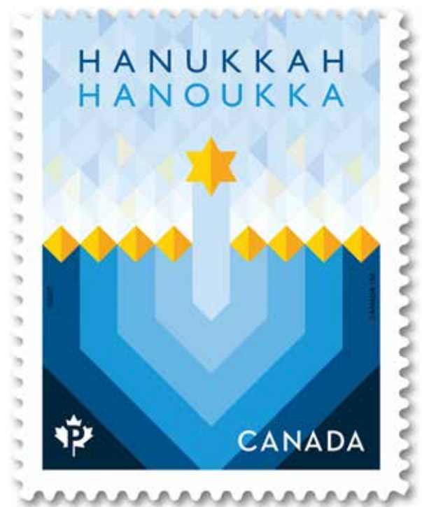
Left: New Israeli Music: Love Songs stamps, issued June 2017. | Above: Canada’s first Chanukah stamp, issued November 20, 2017.