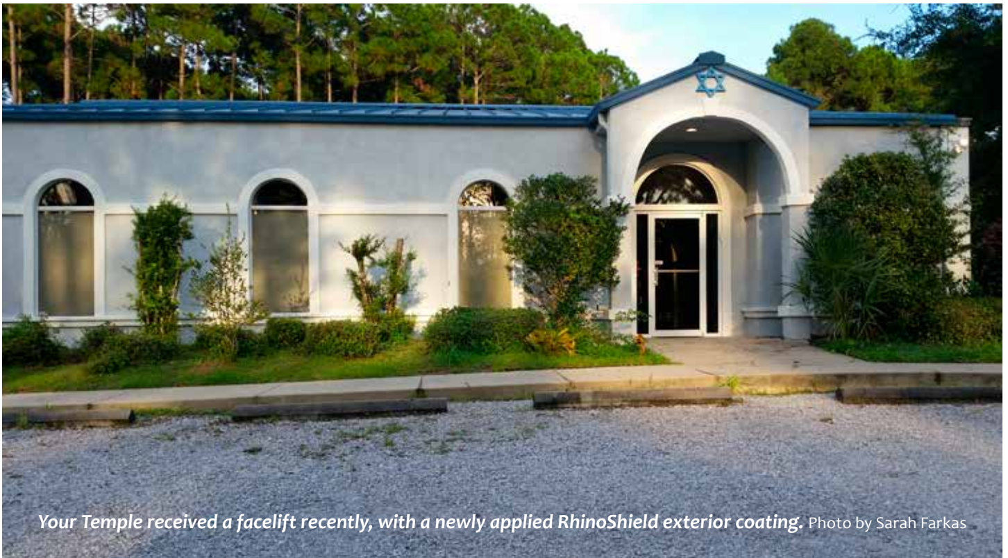
Your Temple received a facelift recently, with a newly applied RhinoShield exterior coating.